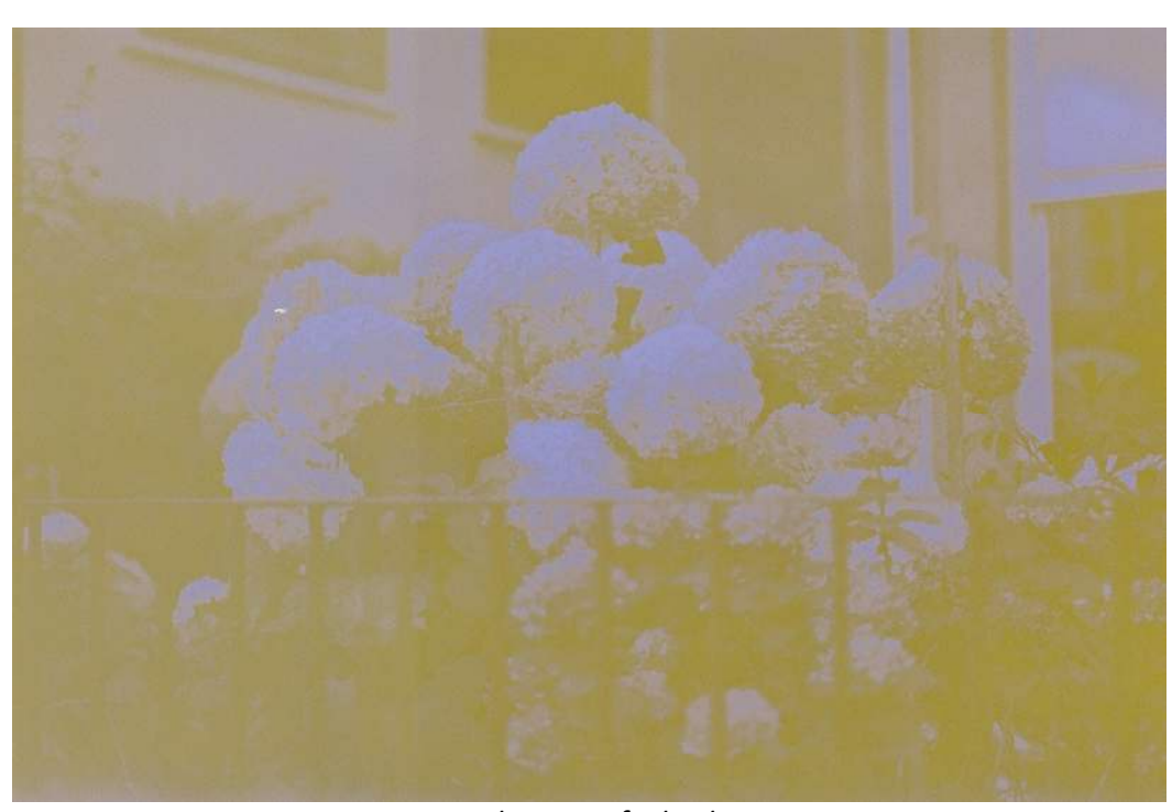
A close-up of a bush