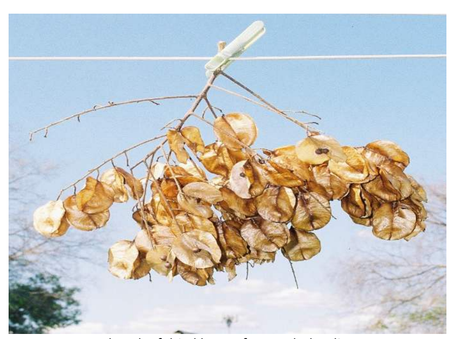
A bunch of dried leaves from a clothes line

Following are some photos taken during the workshop.