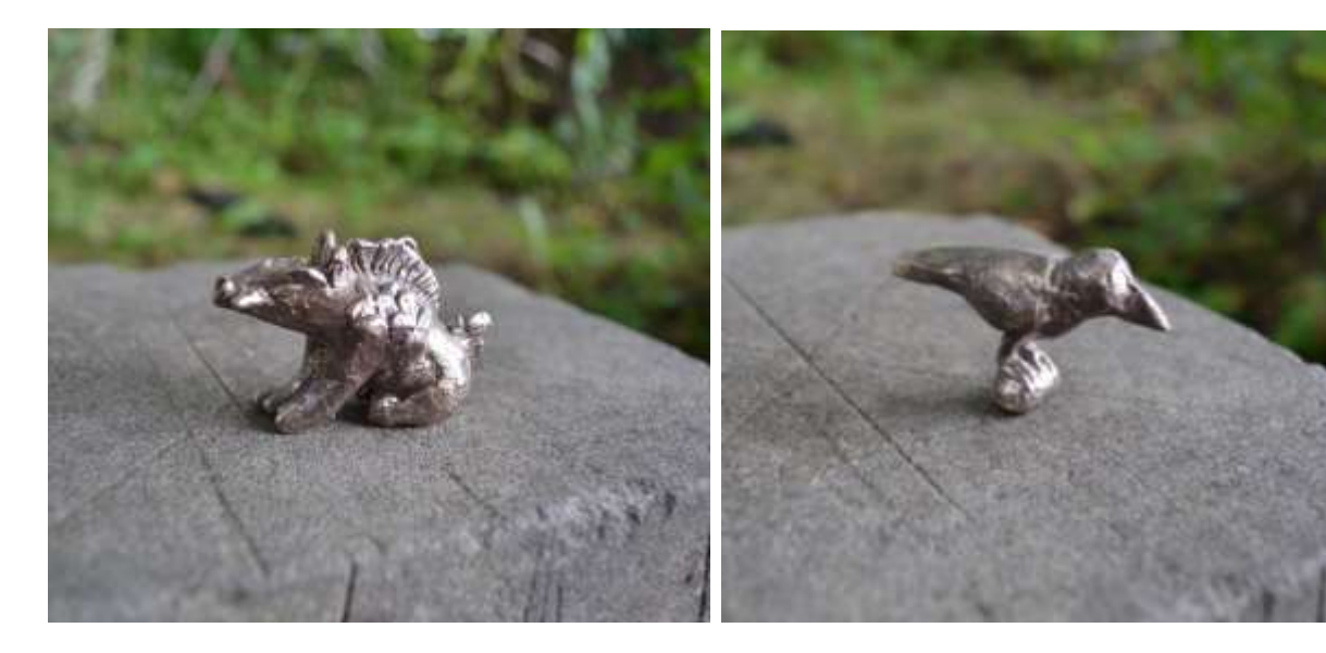
Open Access: Bronze boar and crow based on bronze objects seen in the British Museum