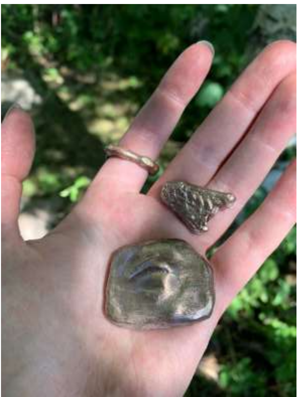
Bronze Age Casting Course: Furnace with clay moulds, heating them to pour out the wax. Finished Bronze works.