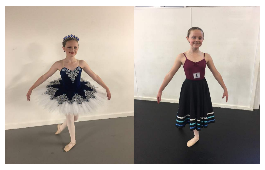
Competition ready classical ballet