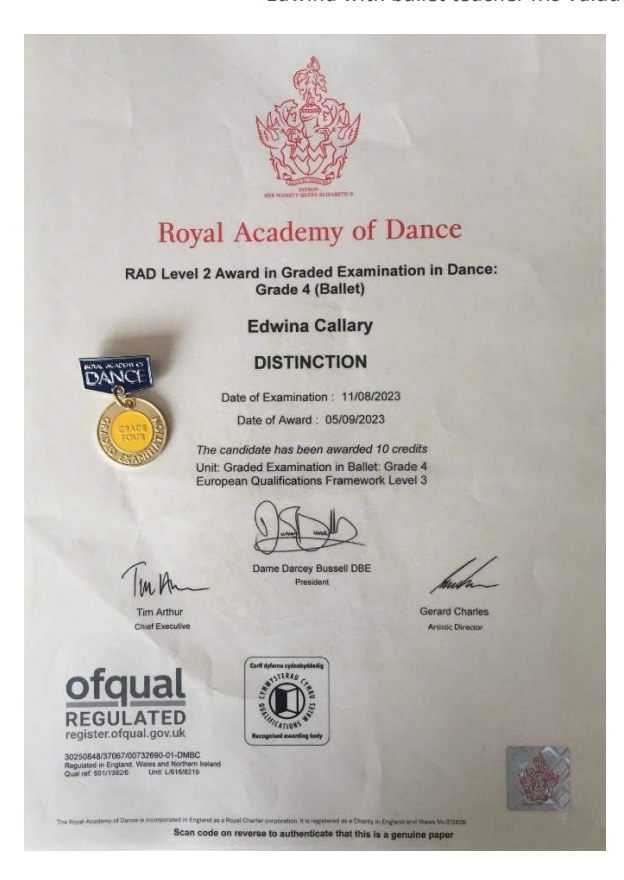
Edwina Callery - Rad Grade 4 Certificate