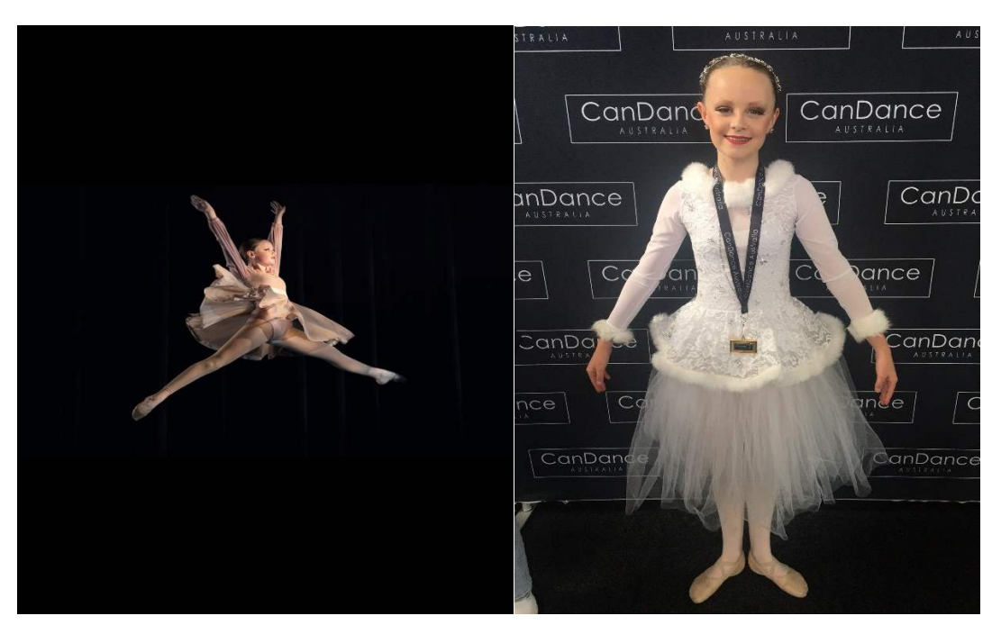
2023 concert solo