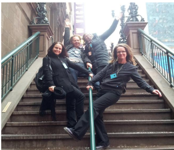
Spreading the word...!

At all times everyone involved maintained an acute awareness of the VIPs at the heart of the whole exercise – the babies who came to the show.