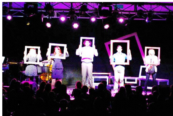
On the stage