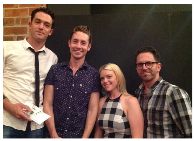
"five.point.one" at the Adelaide Critics' Circle Awards

The annual Adelaide Critics' Circle Awards, also held in December, were attended by a capacity crowd at the University of Adelaide's Little Theatre. IAF sponsors the Innovation in the Arts Award which went to the production "Notoriously Yours" by the theatre company "five.point.one" IAF supported one of their first productions a few years ago.