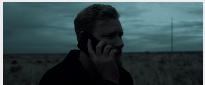
Stills from the finished production of 'Thereafter'.