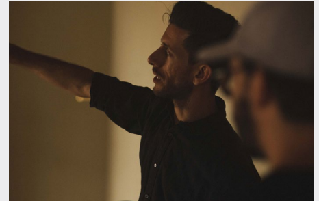
Behind-the-scenes stills of the production of 'Thereafter'.

Taking place over four consecutive days, we filmed in a variety of locations, including a house in the Adelaide Hills, an abandoned building in Magill, an endless field at Buckland Park, as well as supporting locations in North Adelaide and Myponga Beach.