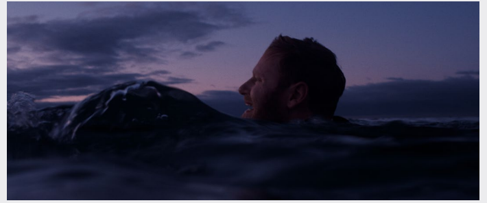
Stills from the finished production of 'Thereafter'.

Post-production involved a lot of long hours in the edit room, getting creative again, chopping up the film and trying new combinations, as well as colouring and completing the visual effects. Over the course of this experience, we worked closely with our amazing composer, and finally, our sound mixer, who has been adding the remaining sound effects to the film, and mastering the final audio track.