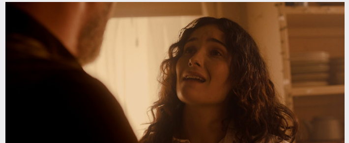
Stills from the finished production of 'Thereafter'.