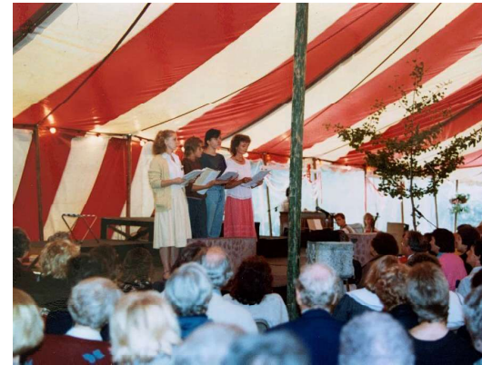
Photo: The workshop marquee at Eurilla

As you can imagine, the organisation was complicated: 310 people were coming on the train, with another 90 driving themselves. The train had to be decorated, we served champagne and crayfish sandwiches on the way up, and port, cheese and meringues on the way back. I had to get to the station early on the Sunday morning to get the champagne, glasses, and food into each carriage.